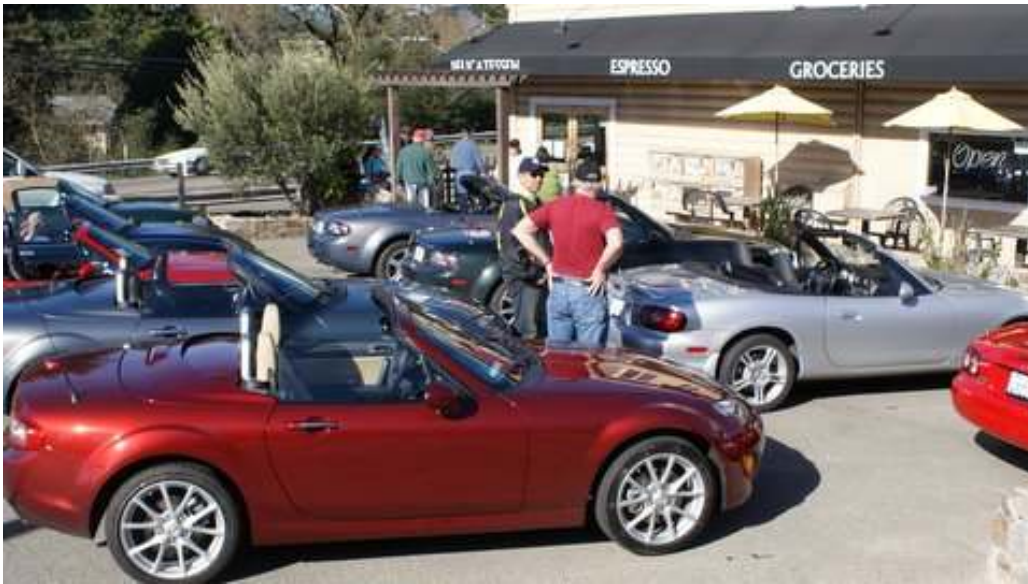
Front parking area with the sightseers group