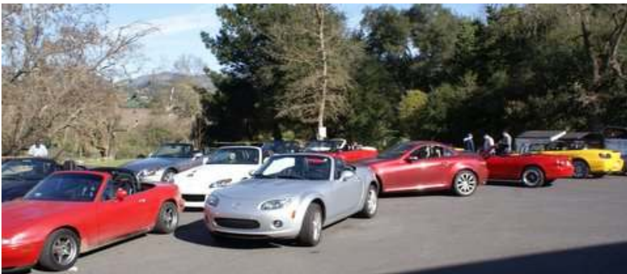
Back parking area

The weather couldn't have been better. The sun was bright, the fields were green and full of flowers, and traffic didn't present a problem. Diana kept the sightseer group together as we followed the route. We arrived at our mid-stopping point as the vehicles positioned themselves into multiple rows in the front and back parking areas. Some people parted from this area to another adventure: Cat Black and Ken Johnson headed to the Napa Wine Train, while Ralph and JoAnne headed to Napa for lunch and shopping. The main groups headed back to Winters.