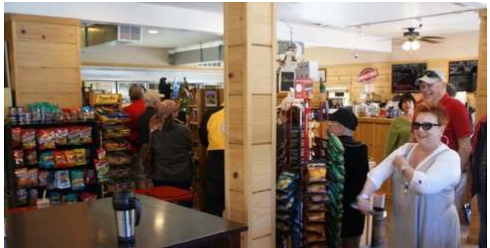
The long line formed for the bathroom as others fueled their selves.